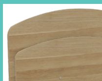
Laminate Curved Style

Custom Endboard styles & colours available upon request.