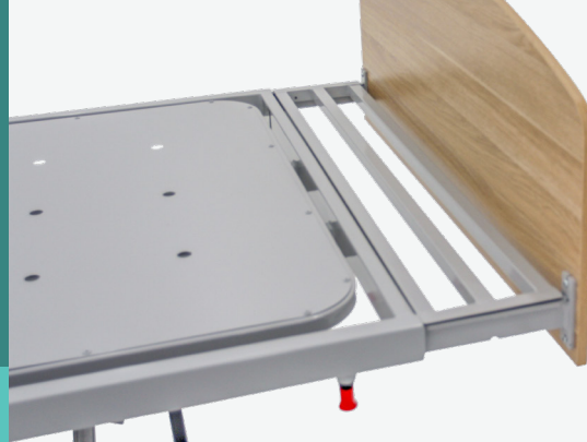
Pull Out extension as standard