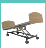
Forward & Reverse Trendelenburg