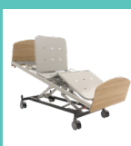
Chair Position Function