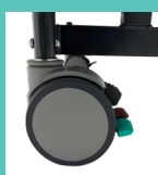
125mm Braking & Directional Castors