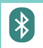
Bluetooth Connectivity ***handset must be ordered separately***