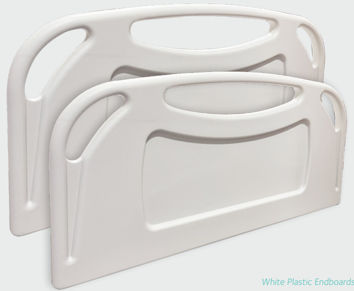
White Plastic Endboards