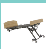
Forward & Reverse Trendelenburg