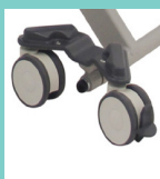
100mm Twin Wheel Braking Castors