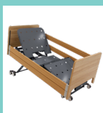
Chair Position Function