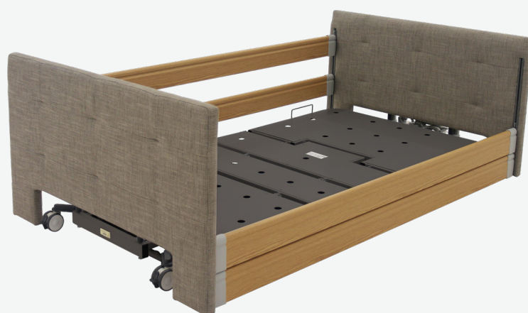
Custom Jersey Endboards