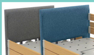
Upholstered Plain Headboard & Footboard