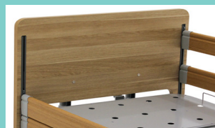
Laminate Square Headboard & Footboard

Custom Endboard, styles and colours also available.