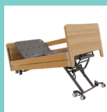
Forward & Reverse Trendelenburg