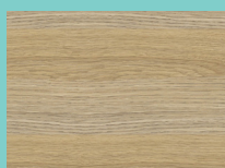
Natural Oak Laminate