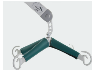
4 Point Yoke