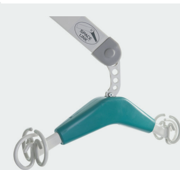
Tri Hook Yoke