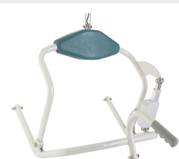
Powered Pivot Frame